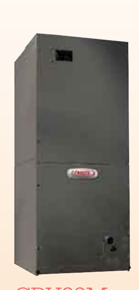
Efficient, environmentally responsible air handler