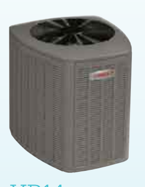
XP14 Reliable and responsible home comfort

This page is for summary purposes only. Please refer to Lennox product literature for full details.